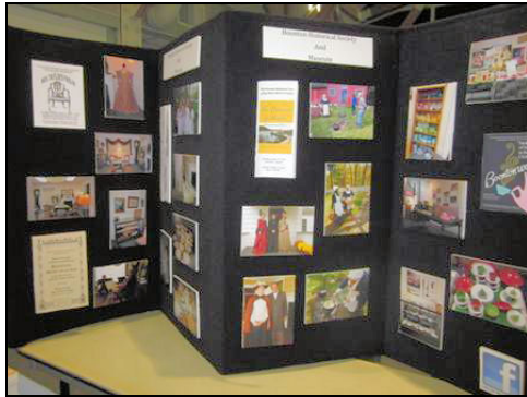
Boonton Museum's Display at Olde Pequannock Day