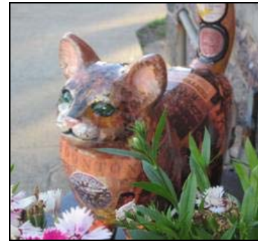
A cool cat at the Boonton Museum "Boonton Centennial Cat 1967" Sponsored by the Charlton Family

Free to members, there is a $5.00 suggested donation for non-members.