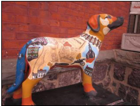
Boone Towne 1867